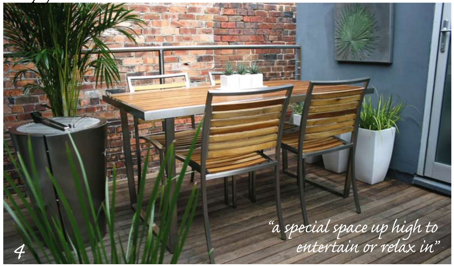
4. A streamlined dining setting and a portable barbecue are all it takes to create the perfect entertaining area on a balcony.

5. Lightweight planters provide the perfect container for this small formal balcony garden. A wall-mounted water feature adds a central focal point. Buxus sempervirens forms a low hedge to frame the standard white camellias.